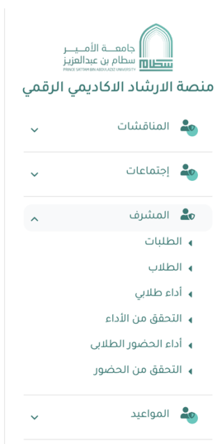
{\it Figure 4 Screenshot from the Academic advising platform}